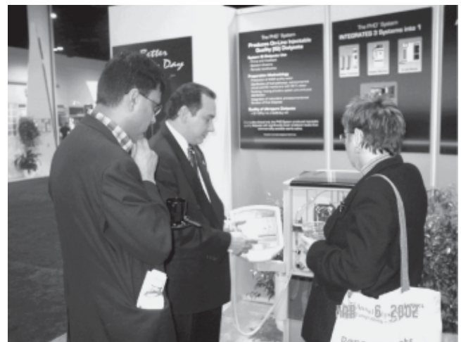
FIGURE 3 The Personal Hemodialysis System (PHD®; Aksys, Ltd.), one of the machines designed for daily home hemodialysis and exhibited at the 2002 Annual Dialysis Conference in Tampa, will be demonstrated in the special workshop on home hemodialysis machines.

In the early days of chronic hemodialysis, it was noted that many symptoms were significantly more frequent in hemodialysis patients than in the general population, and were